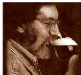
Michael Jackson—The Beer Hunter

What do you receive for your donation? One opportunity to purchase EACH of the four featured beers. Cost per beer is $6 and that price will only be offered to ticket holders for as long as the beer lasts! In addition, The J. Clyde donates $3 per beer sold on March 27th to Free the Hops .